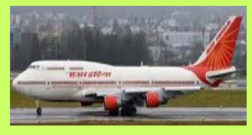
86 Boeing 747