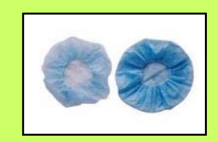
Head + hair