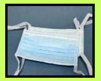
Nose + mouth