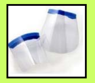
Eyes + nose + mouth