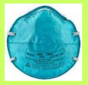
Nose + mouth